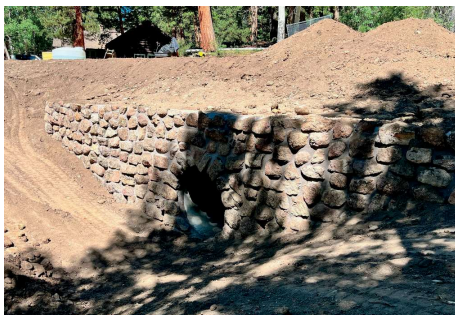
Construction on the ROMO project

Our IDIQ at Smithsonian Institute also continues to grow in task orders and has grown with work taking place at National Museum of African American History and Culture, National Museum of Air and Space at Dulles, National Museum of the American Indian, and the Smithsonian Quadrangle.