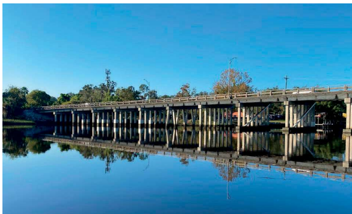
Underwater Inspections of bridges