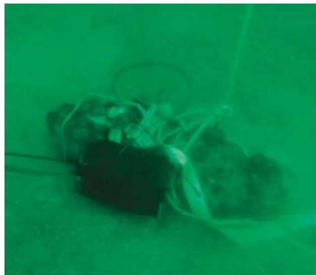
100 lb bomb

AOR international has had a successful year to date! At the end of 2022, AOR began dive operations at Eglin Airforce Base located in Florida. This effort continued in 2023 until an unexpected 100-pound bomb was discovered. As this bomb was not anticipated or accounted for in planning documents, we were not equipped to safely detonate the bomb. Therefore, the Air Force EOD division was dispatched to find and detonate the bomb at an offshore demolition range.